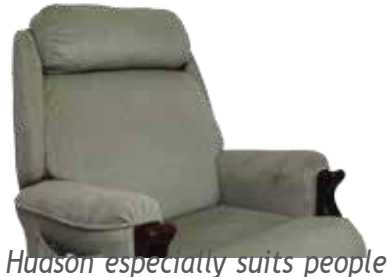
recovering from back surgery or general lower back pain.

Hudson has a two-roll back. The lower back pad is made from foam and has better lower `back support.